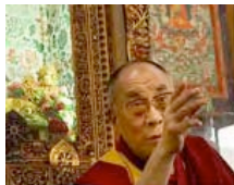
Video Dalai Lama says he can't ask Tibetans to "Shut Up"