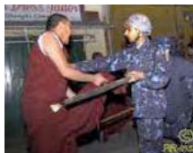
Video Protesting monks beaten in Nepal