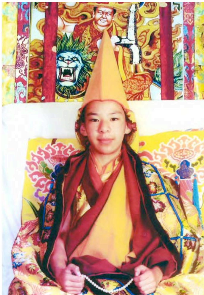
The China sanctioned Panchen Lama pictured with Dorje Shugden as his backdrop

China sanctioned Panchen Lama is 19 years old now. He is taking on his role of Tibet's Highest Lama within Tibet/China more and more. The Chinese Government although saying they are Socialist and do not believe in any religion, still backs up the highest ranking lama within Tibet. Panchen Lama is endorsed by the Central Government of Beijing and all his expenses borne by them also. He has State ranking.