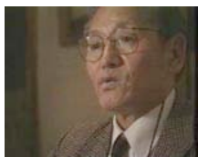
Dalai Lama & Dorje Shugden Video Part 2