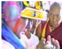
Dorje Shugden Oracle video 2