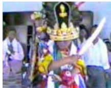
Dorje Shugden Oracle video 3