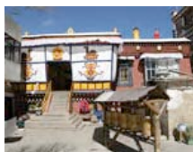
watch video of Trode Khangsar, Lhasa, Tibet (Home of Dorje Shugden)