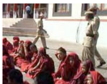
watch video of the infamous red/yellow stick referendum on Dorje Shugden