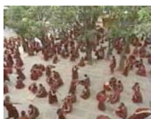
Dalai Lama & Dorje Shugden