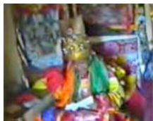
Dorje Shugden Oracle video 1

"They can bury me in earth, drown me in water, burn me in fire but they cannot destroy what is not object to destruction. Do not worry – soon the sun will "