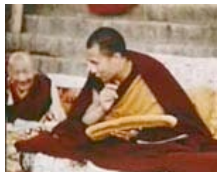
Dalai Lama & Dorje Shugden Video Part 3

first spread in China 's 1.2 billion populations. The Chinese will 100% believe that Dorje Shugden is beneficial. After all, who will they choose to believe? Their own Government who is opening the doors to economic free trade and creating wealthy citizens or the Dalai Lama?